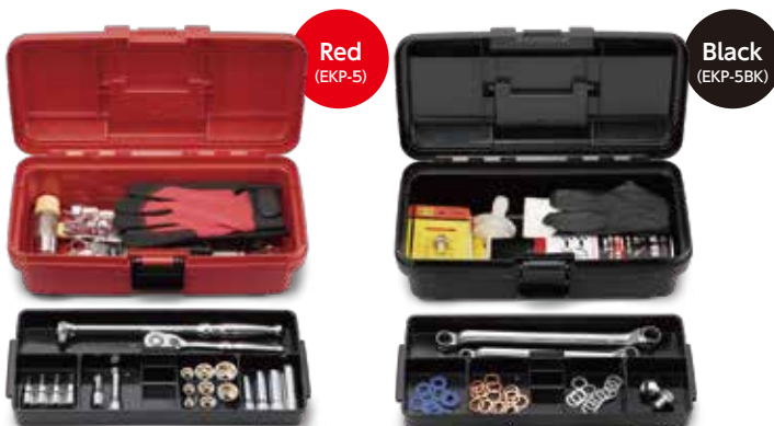
Everyday maintenance tools stored in "red."

Smart Design for Secure, Easy Transport From Work Tools to Hobby Essentials—All Neatly Packed