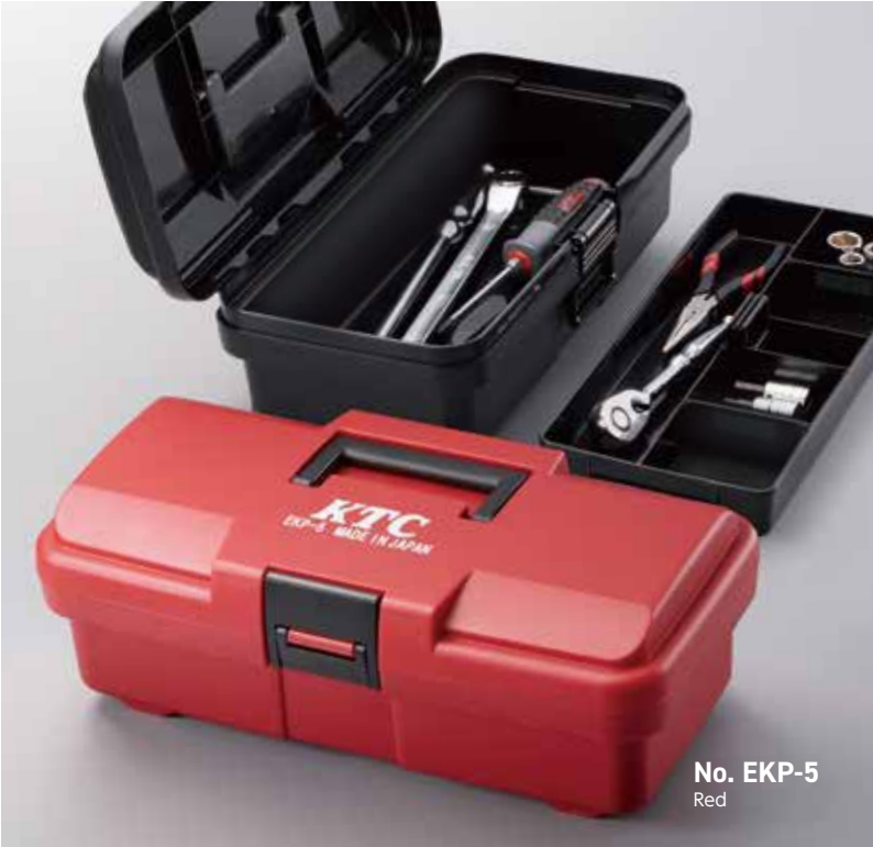
No. EKP-5 Red