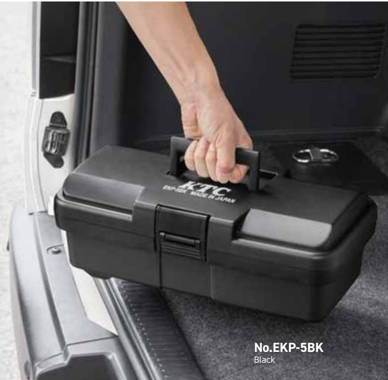
No. EKP-5BK Black