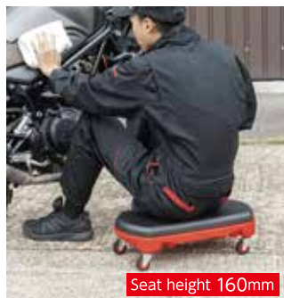
Seat height 160mm

The seat is removable and can be adjusted according to the work area, allowing you to stay comfortable even during long periods of sitting, while reducing strain on your body.