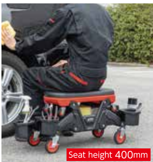
Seat height 400mm