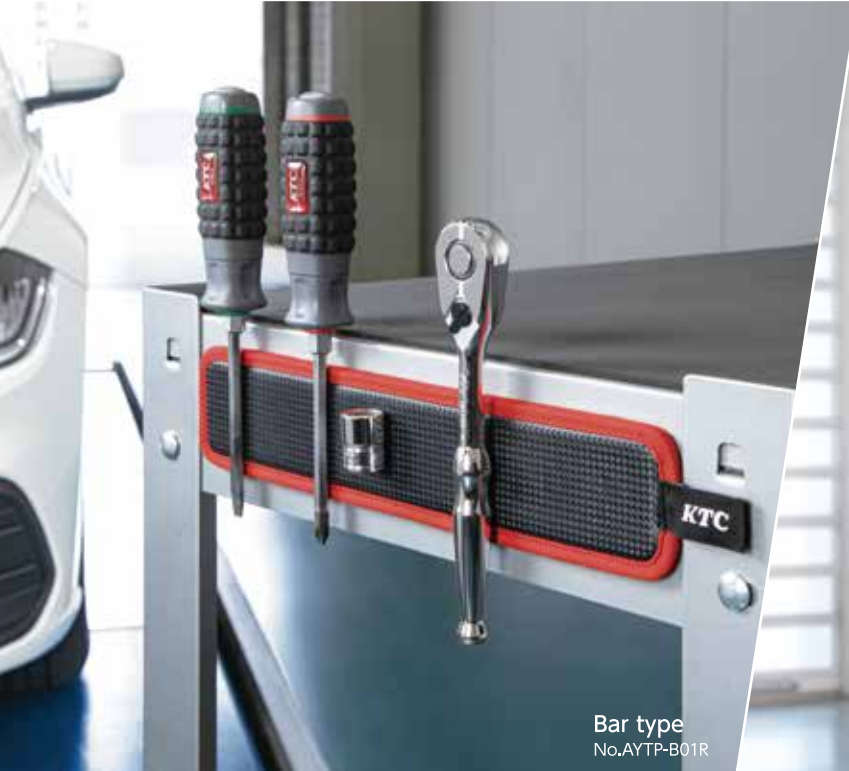
Bar type No.AYTP-B01R