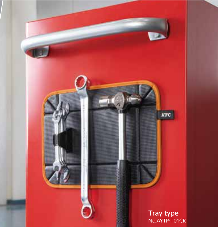
Tray type No.AYTP-T01CR