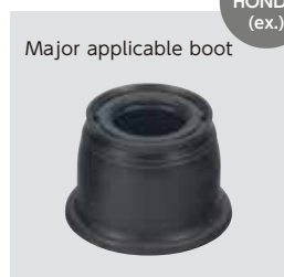
Major applicable boot