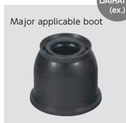
Major applicable boot