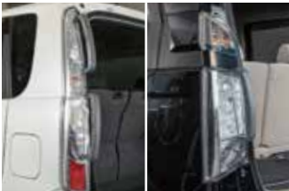
Easily remove taillight by using plural removers without damaging the body.