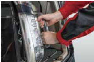
You can remove small taillight certainly by using additional suction cups.